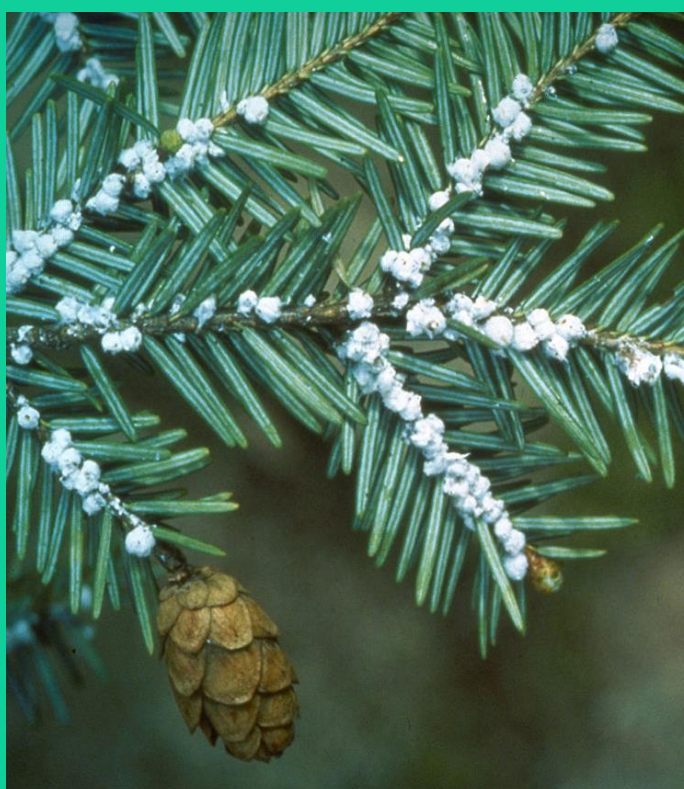
Hemlock Woolly Adelgid

Find the full priority list at WWW.WRISC.ORG